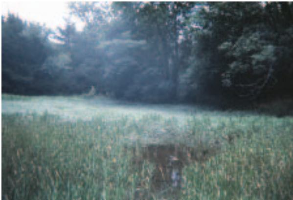
Plate 1. View of site N1 in Bourbon County, Kansas. A shallow artificial pond chiefly fed by a small ephemeral stream that originates in and runs through a meadow and a wooded area. DOI: 10.1514/journal.arc.0040014g002

ing success of eggs and the malformation rates of their hatched tadpoles incubated in the laboratory.