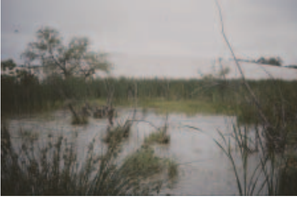
Plate 8. View of site M2 in Cherokee County, Kansas. A man-made pool at the edge of a pile of mining spoils (chat) left over from lead and zinc mining. DOI: 10.1514/journal.arc.0040014g009