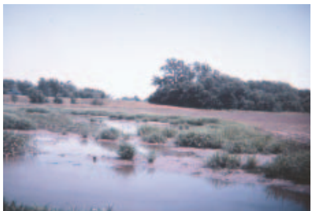
Plate 4. View of site A2 in Cherokee County, Kansas. A natural wetland surrounded on three sides by a plowed crop field. DOI: 10.1514/journal.arc.0040014g005

(Figure 1). Site selection focused on finding anuran breeding pools located in “micro-watersheds” with different immediate surrounding land uses. Three land uses were considered: agricultural, mined, and natural. Agricultural areas were plowed fields and row crops. Areas with live-