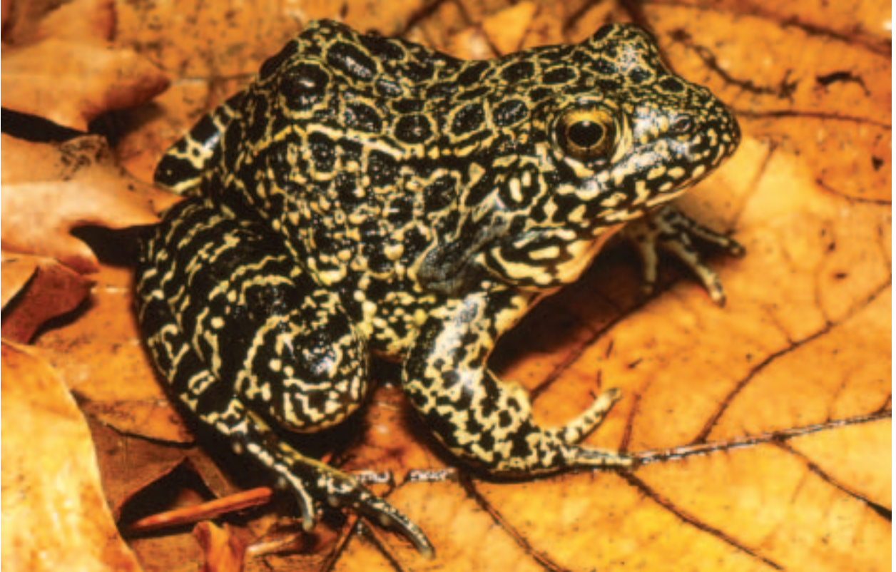
Plate 14. Crawfish Frog, Rana areolata .