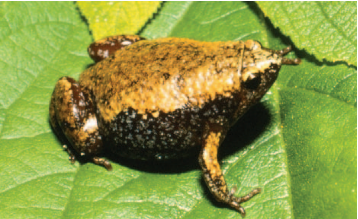
Plate 9. Eastern Narrowmouth Toad, Gastrophryne carolinensis .

Visual density of the H. versicolor/chrysocephala complex was significantly higher in natural sites compared to agricultural sites (Table 2). The same pattern existed for audio density, but was not significant. Audio and visual density of