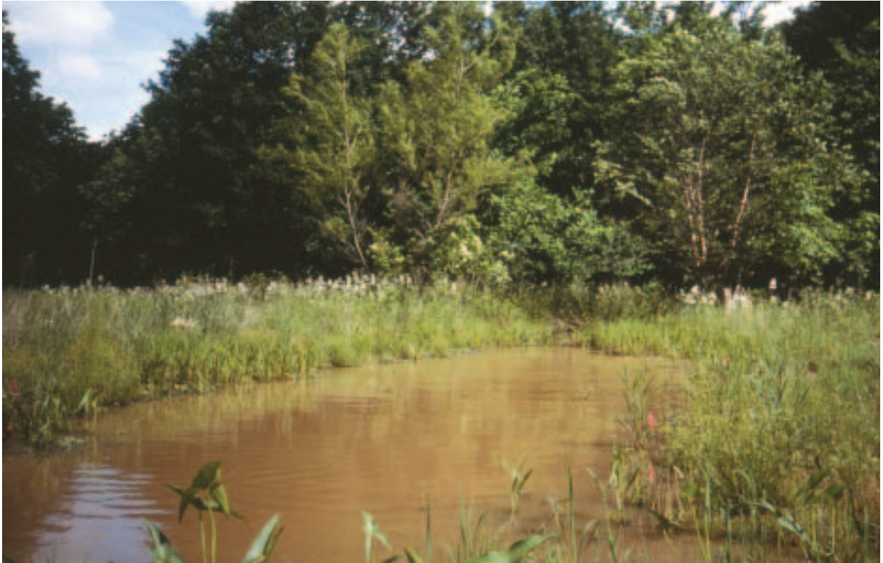
Plate 5. View of site A3 in Cherokee County, Kansas. A natural pool on the edge of a plowed crop field. DOI: 10.1514/journal.arc.0040014g006