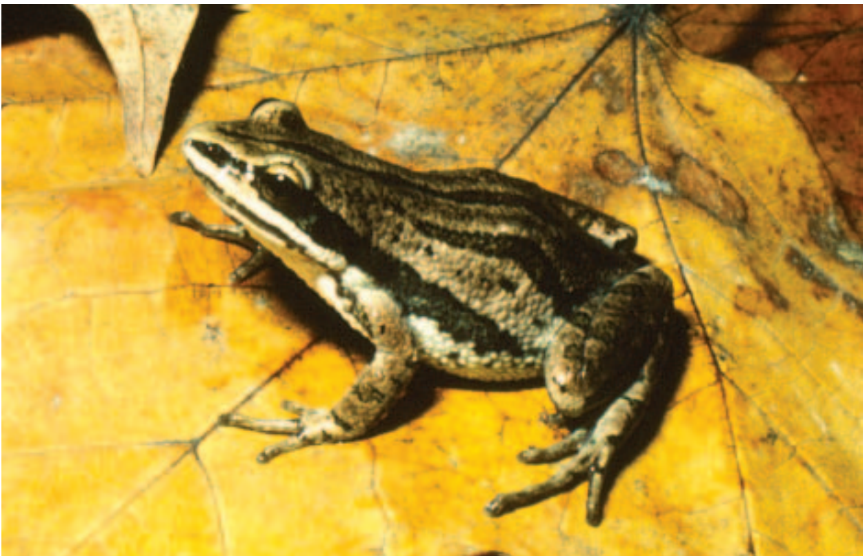
Plate 11. Western Chorus Frog, Pseudacris triseriata .