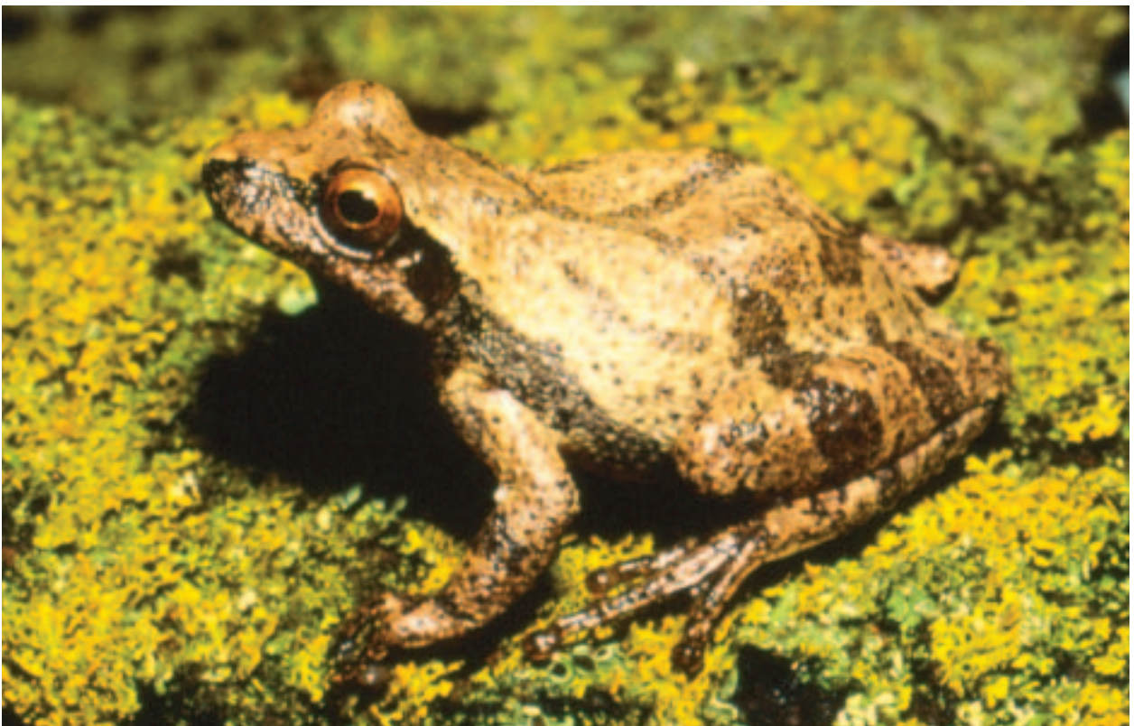
Plate 15. Spring Peeper, Pseudacris crucifer .