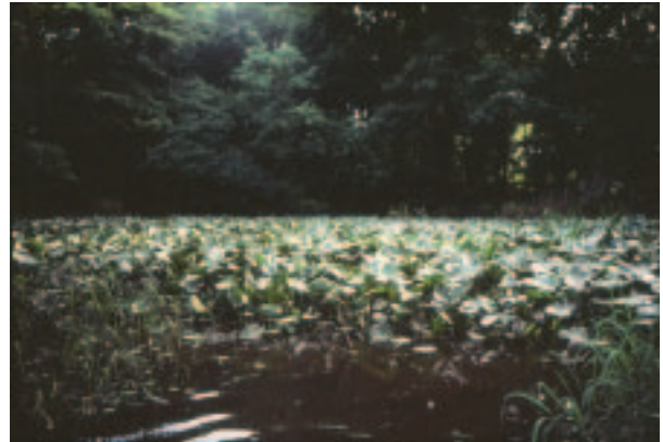
Plate 2. View of site N2 in Cherokee County, Kansas. A shallow artificial pond fed by runoff from a mature woodland area. DOI: 10.1514/journal.arc.0040014g003

The study area is located in the Osage Cuestas physiographic region in three counties in southeast Kansas USA