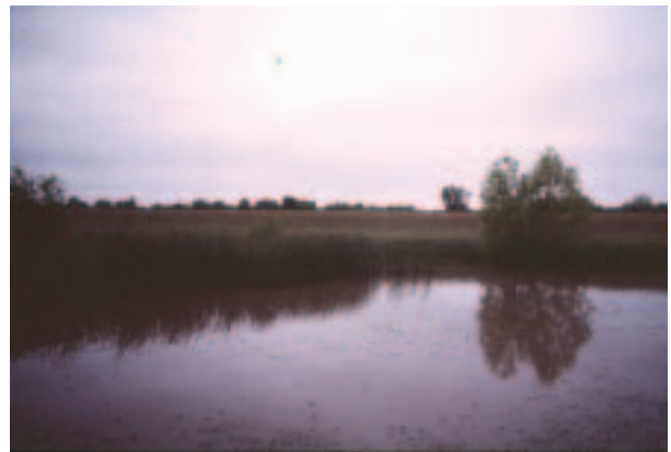
Plate 3. View of site A1 in Bourbon County, Kansas. A shallow man-made pond adjacent to a plowed crop field. DOI: 10.1514/journal.arc.0040014g004