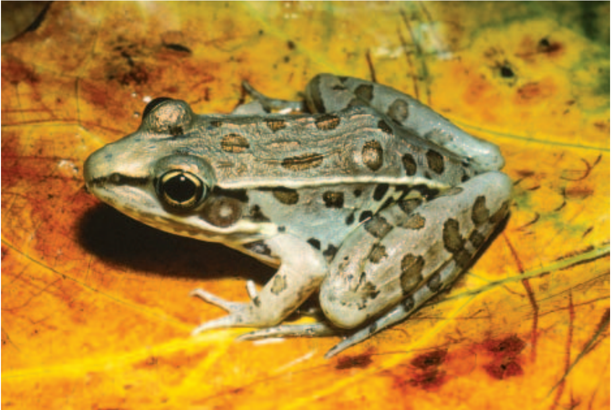
Plate 10. Southern Leopard Frog, Rana sphenocephala .