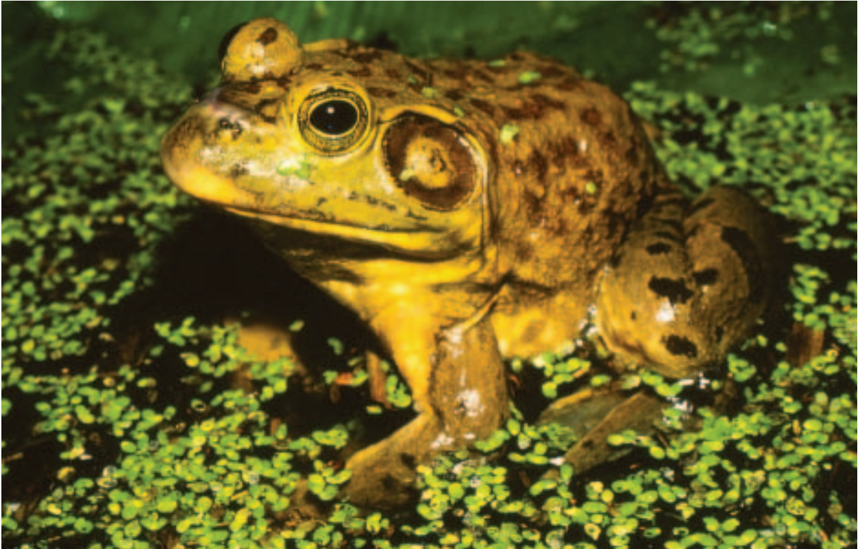
Plate 16. Bullfrog, Rana catesbeiana .