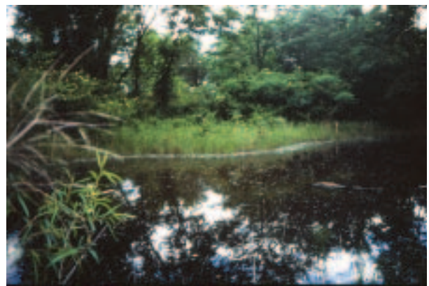
Plate 7. View of site M1 in Crawford County, Kansas. A shallow pool chiefly fed by a small ephemeral stream that originates in and runs through land that was previously mined for coal. DOI: 10.1514/journal.arc.0040014g008

stock were not used. Mined areas were on land that had clear signs of previous mining activity, including mine tailings. Natural areas were defined as lands with no cultivation, grazing, or mining activities occurring within the micro-watershed now or in the recent past, and approximating an undisturbed vegetative cover.