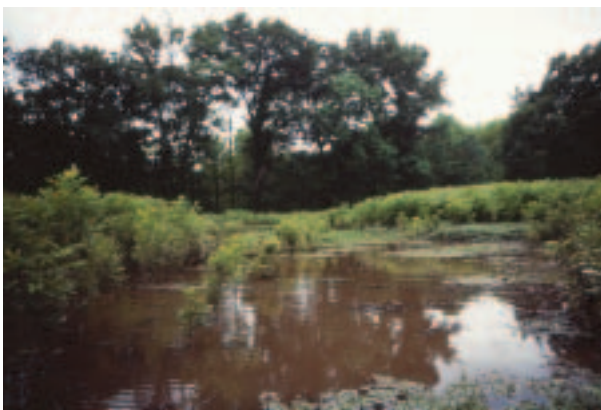
Plate 6. View of site A4 in Cherokee County, Kansas. An artificial wetland in the middle of a plowed crop field. DOI: 10.1514/journal.arc.0040014g007