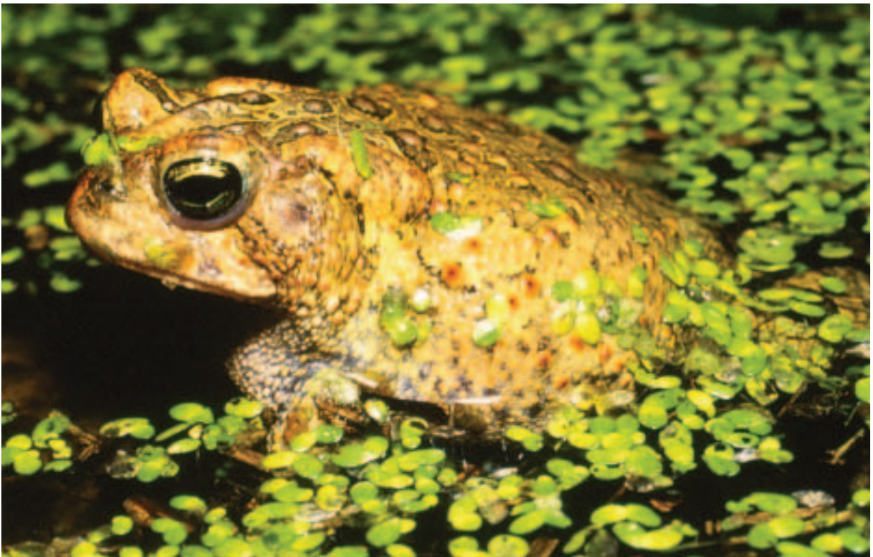
Plate 17. American Toad, Bufo americanus .