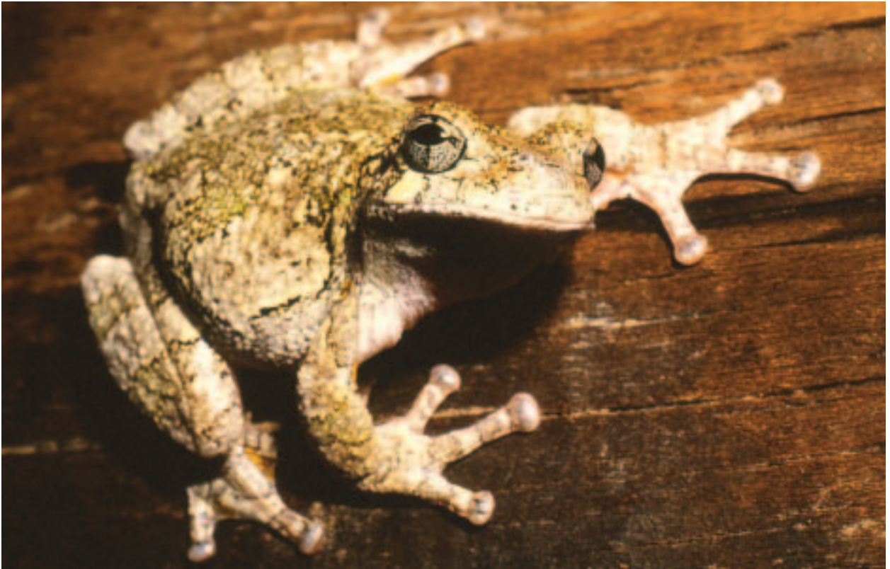
Plate 12. Gray Treefrog, Hyla versicolor/chrysoscelis .