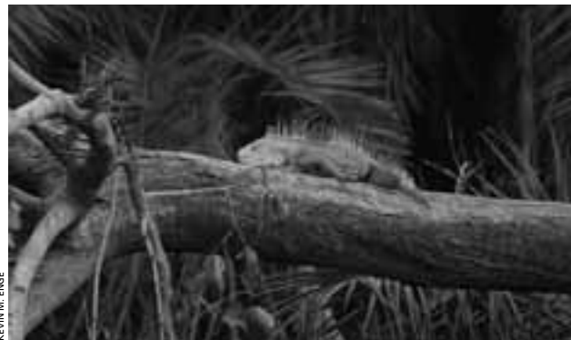
Adult male Green Iguana ( Iguana iguana ) basking on a fallen tree during a cool day at Crandon Park on Key Biscayne, Miami-Dade County, Florida (photographic voucher UF 150121). Non-native Senegal Date Palms ( Phoenix reclinata ) can be seen in the background.

Trapping methods for I. iguana include the use of live traps (e.g., Havahart, Tomahawk) baited with fruit, such as bananas or mangoes, or locking snares that can be set during the daytime at burrow entrances, at holes under fences, or along seawalls (Kern 2004), canals, and ponds. Johnson (2006) used a semicircular mesh trap with a snare at each end (D-I-Y trap) and bait in the center. However, the most common capture method is by noosing with a long pole, especially while lizards are sleeping at night or torpid during cold weather. Some commercial I. iguana catchers use boats to noose lizards from trees at night, sometimes stretching out nets to catch iguanas jumping from trees to the water below (G. Ward, pers. comm.). Persistent harassment may encourage I. iguana to move to the next-door neighbor's yard; this can be accomplished by launching pebbles or palm fruits at them using a slingshot (Kern 2004), spraying them with a hose, or through the use of loud vocalizations on the part of a person or a dog combined with quickly approaching the lizard. Shooting firearms is outlawed in residential areas. 13