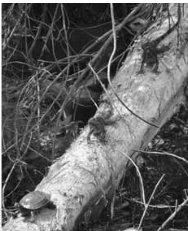
KEVIN M. ENGE

Juvenile Green Iguana ( Iguana iguana ) on a non-native Silk Floss ( Chorisia speciosa ) tree in Lake Worth, Palm Beach County, Florida (photographic voucher UF 149868).