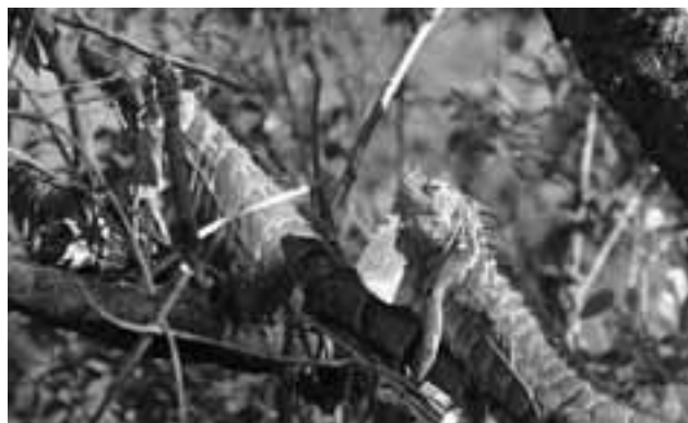
Two Green Iguanas ( Iguana iguana ) on a Strangler Fig ( Ficus aurea ) on Key Largo, Monroe County, Florida (photographic voucher UF 149986). These iguanas were observed feeding on adjacent Spanish Stopper ( Eugenia foetida ).