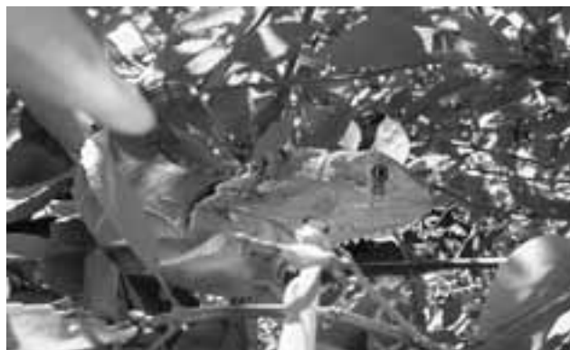
A juvenile Green Iguana ( Iguana iguana ) on a non-native Golden Dewdrop ( Duranta erecta ) in Naples, Collier County, Florida (photographic voucher UF 146274). This iguana appeared to be foraging on fruit from an adjacent Firebush ( Hamelia patens ).