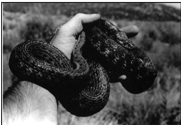
A 45" Sierra garter snake ( Thamnophis couchii ) photographed September 1991 in Kennedy Meadow, Tulare County, California.