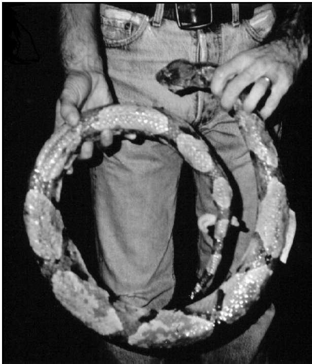
A 50" copperhead ( Agkistrodon contortrix ) in the Louisiana State University Museum of Natural Science collection, killed in Zachary, East Baton Rouge Parish, Louisiana, April 1983.